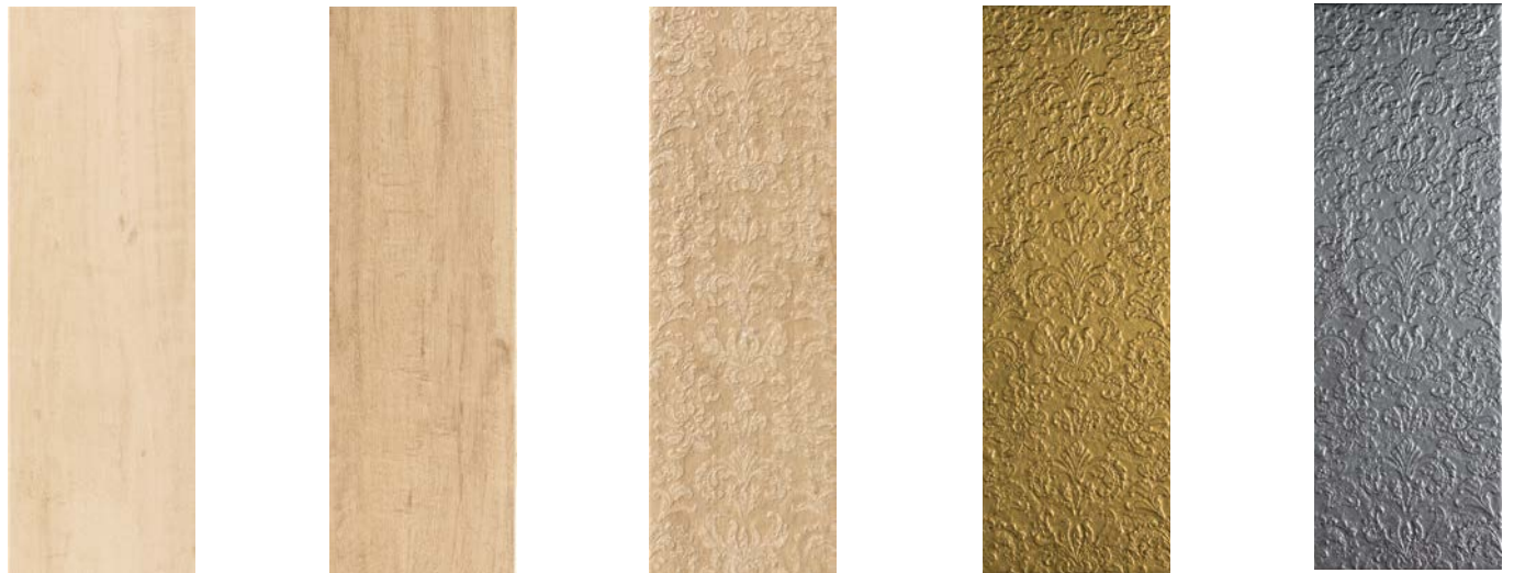
Branch Melawi 25,1 x 75,6 C-550 Branch Oak 25,1 x 75,6 C-550 Branch Oak Reale 25,1 x 75,6 C-550 Reale Gold 25,1 x 75,6 C-357 Reale Silver 25,1 x 75,6 C-357