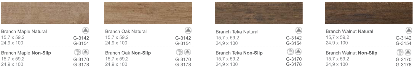
Branch Maple Natural 15,7 x 59,2 24,9 x 100 G-3142 G-3154 Branch Maple Non-Slip 15,7 x 59,2 24,9 x 100 G-3170 G-3178 Branch Oak Natural 15,7 x 59,2 24,9 x 100 G-3142 G-3154 Branch Oak Non-Slip 15,7 x 59,2 24,9 x 100 G-3170 G-3178 Branch Teka Natural 15,7 x 59,2 24,9 x 100 G-3142 G-3154 Branch Teka Non-Slip 15,7 x 59,2 24,9 x 100 G-3170 G-3178 Branch Walnut Natural 15,7 x 59,2 24,9 x 100 G-3142 G-3154 Branch Walnut Non-Slip 15,7 x 59,2 24,9 x 100 G-3170 G-3178

Class 3 NonSlip Finish * Class 1 Natural Finish *